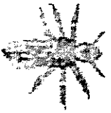
Nymph form.

Nymph: A nymph is an immature louse that hatches from the nit. A nymph looks like an adult head louse, but is smaller. To live, a nymph must feed on blood. Nymphs mature into adults about 9–12 days after hatching from the nit.