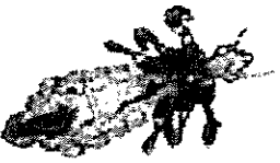
Adult louse.

Nymph: A nymph is an immature louse that hatches from the nit. A nymph looks like an adult head louse, but is smaller. To live, a nymph must feed on blood. Nymphs mature into adults about 9–12 days after hatching from the nit.