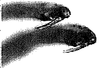
Adult louse claws.

Adult: The fully grown and developed adult louse is about the size of a sesame seed, has six legs, and is tan to grayish-white in color. Adult head lice may look darker in persons with dark hair than in persons with light hair. To survive, adult head lice must feed on blood. An adult head louse can live about 30 days on a person's head but will die within one or two days if it falls off a person. Adult female head lice are usually larger than males and can lay about six eggs each day.